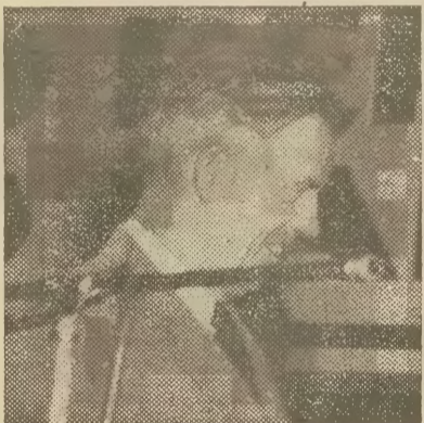
WALLACE after his courageous southern tour.